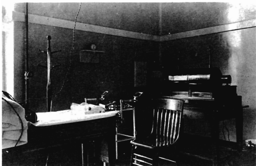
Gynecological examination room, 1907

new apparatus a great many more patients were actually seen as well, but the available working space was not actually increased very considerably.