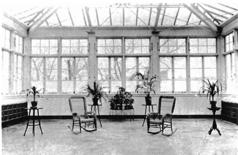
Departmental sun parlor, 1907