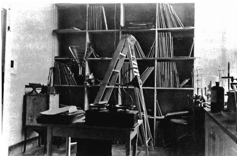
Plate storage room, 1907