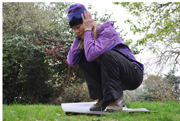
Figure 3. Lightning position.

This panel recommends the separation of group members by greater than 20 feet to limit potential mass casualties, as lightning can jump up to 15 feet between objects. Although each individual should be aware of lightning