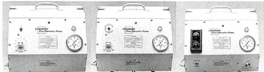
Model 55-JS: Provides continuous suction